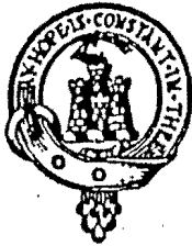
MACDONALD OF CLANRANALD

Our current membership dues are $25.00 per year. Life memberships are available for $250.00.