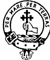
MACDONELL OF KEPPOCH