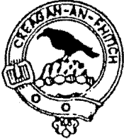
MACDONELL OF GLENGARRY