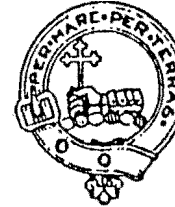
MACDONALD OF SLEAT